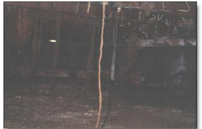
Entrance to crawlspace